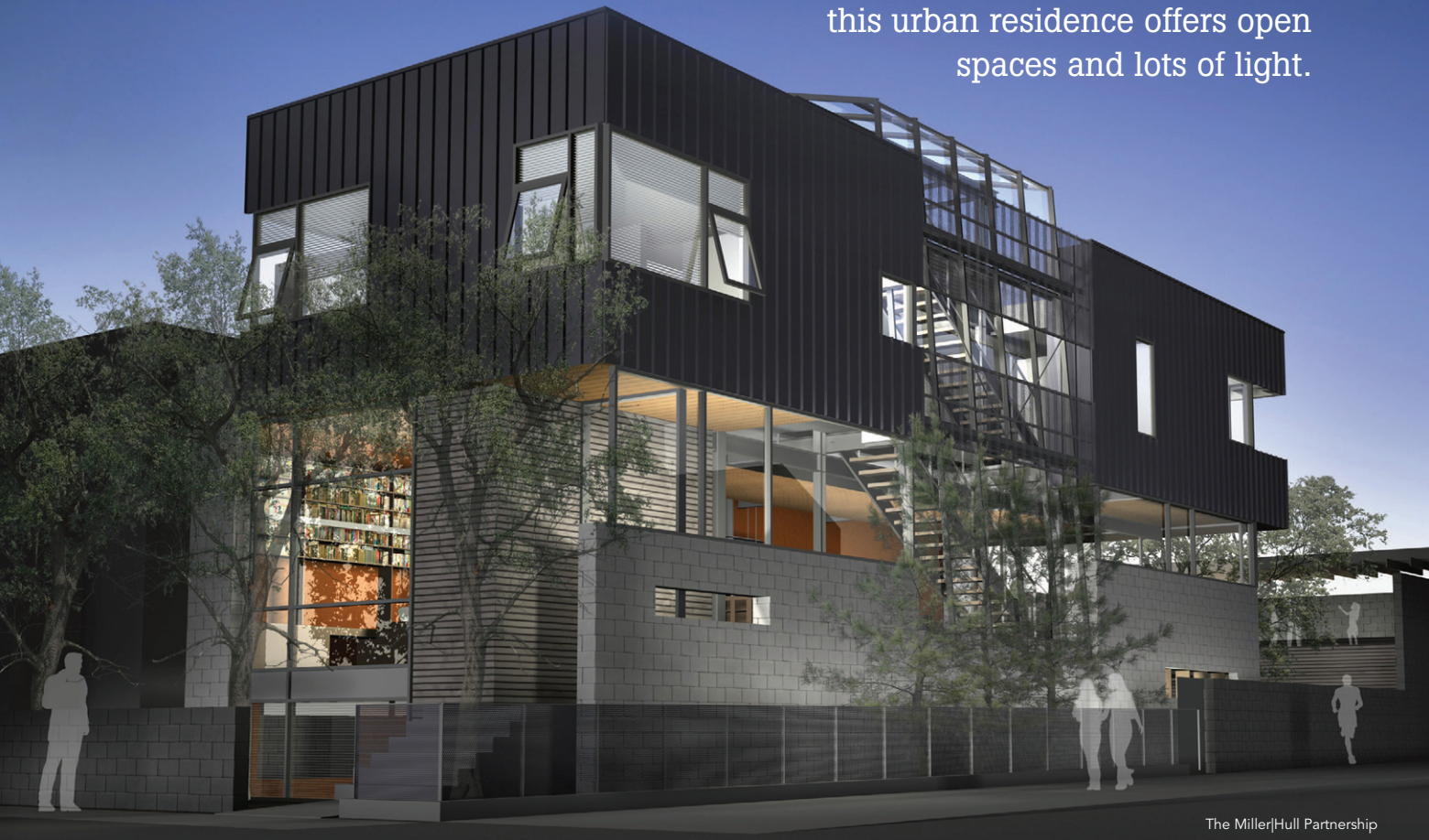
The Miller|Hull Partnership

Conceived with a spine of steel, this urban residence offers open spaces and lots of light.